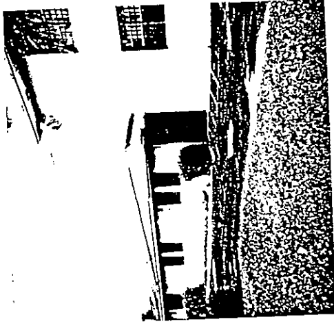
BLDG # 1 LCCS