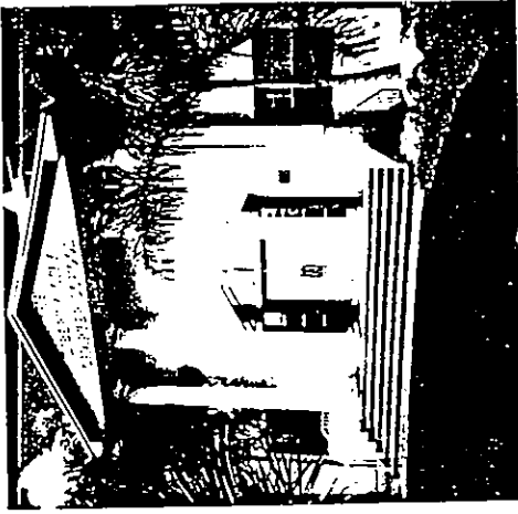
BLDG # 2 LCCS