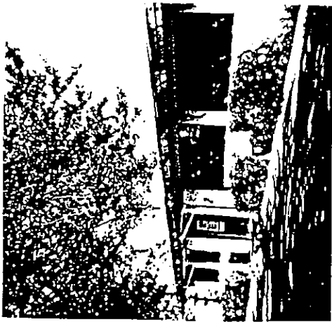
BLDG # 1 LCCS