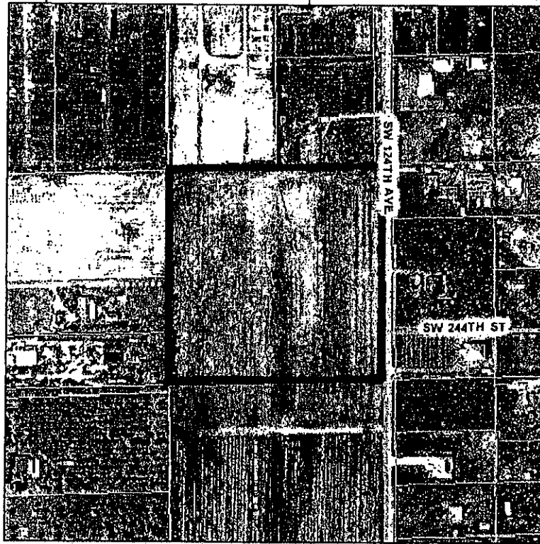
LOCATION MAP: PORTION OF SECTION 24-56-39 NOT TO SCALE