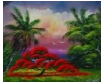
Paintings by Florida Highwaymen for sale.

will be inside the spacious air conditioned Arnold Hall with another 100 outside exhibitors. Great food and