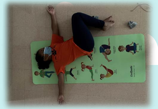
Yoga & Mindfulness