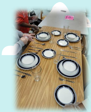
Cooking & Etiquette Training