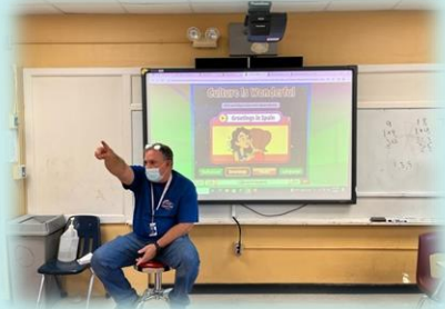
Social Emotional Learning Activities